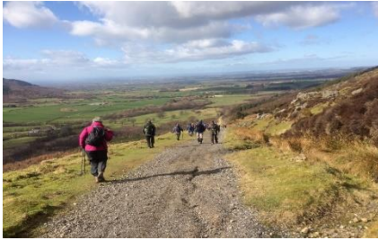
Over the Hill members literally going downhill in March 2019 – down the Ingleby Incline on the old Rosedale Railway Line