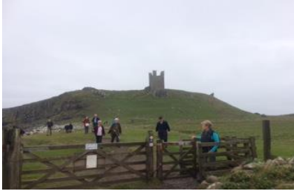
Ramblers passing Dunstanburgh Castle on their weekend walking in Northumbria in early May 2019