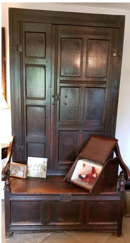
The bacon bench or bacon settle was included in the 1694 inventory of the Hall

Editors Note. Please see pictures below and those on page 22