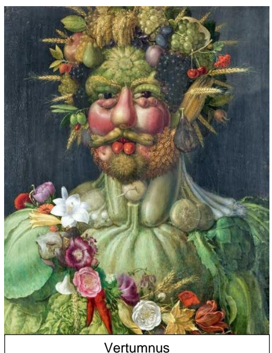
Giuseppe Arcimboldo 1591

The subject of Mannerist Painting had to be covered rather sketchily, as it spread throughout 16th Century Europe. The major Italian artists such as Pontormo, Bronzino, Tintoretto and Titian could only be represented by a few typical paintings. Each of these artists broke from Raphael's 'perfection' in their own style. This was particularly true of El Greco, and for lighter relief, Arcimboldo.