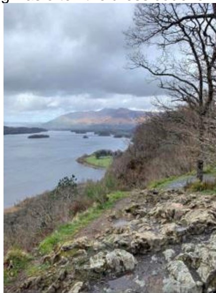
Derwentwater looking north from Surprise View.

weather was not the best and wet weather clothing was often the dress code for the day.