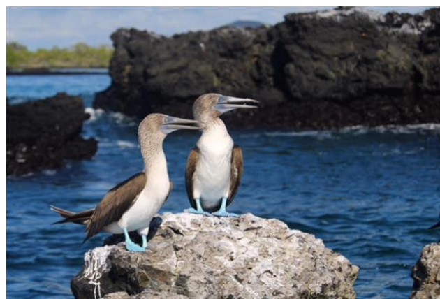
Blue Footed Boobies

There are many active volcanoes. Because of its position on the equator (hence its name) there are no seasons, just varying amounts of rainfall.