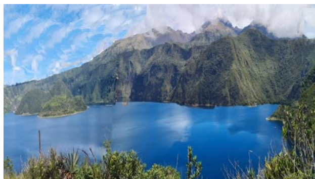
Volcanic Crater Lake

The main topic of the meeting was our recent visit to Ecuador and the Galápagos, a beautiful Spanish-speaking country with extremely varied scenery and wildlife, from Amazon rainforest, the Pacific coast and of course the Galápagos Islands, about 800 km away.