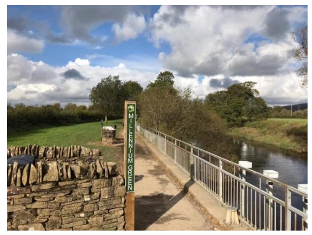
Garstang Millennium Green

The walk, via Greenhalgh Castle, Lingart Lane, Woodacre Hall and Garstang Millennium Green is on footpaths with some steps, farm tracks, across fields and short sections on quiet roads.