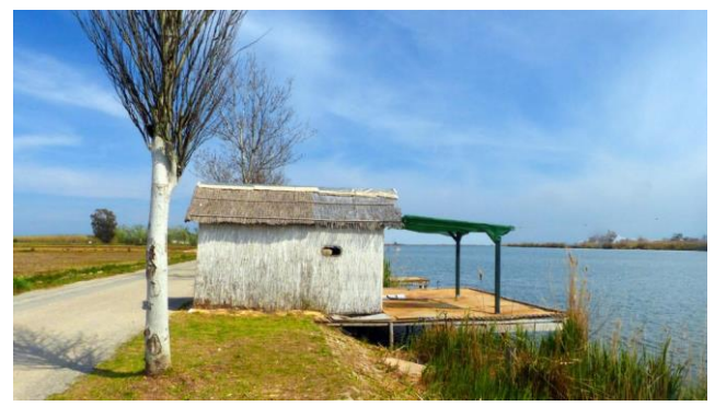
River Ebro Delta

In the second half of the meeting there were group activities to research different aspects of the River Ebro and its delta.