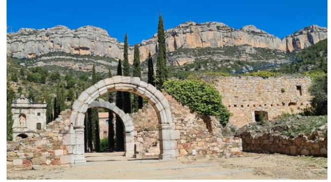
Carthusian Monastery Scala Dei

The Priorat produces intense, full-bodied red wines, now highly regarded internationally. Grape growing and wine production dates from the 12th C, introduced by the monks from the Carthusian Monastery Scala Dei. It is quite a mountainous area and the vines are often grown on terraces, on rocky soils.