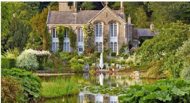
Gresgarth Hall: Subject of talk at August meeting.