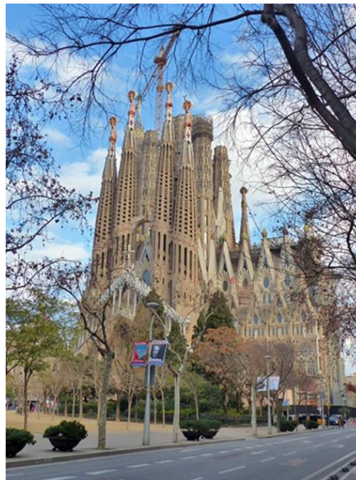
Sagrada Familia Basilica, Barcelona

At the July meeting, Barcelona was the topic for the first part of the afternoon. We looked at the architectural movement called ‘modernisme’, which was very popular at the turn of the 19th - 20th centuries. Its main features are the use of curves and shapes from nature, with rich decoration and bright colours. The architect most associated with this style is Gaudi and his most famous legacies are the Sagrada Familia Basilica, some distinctive apartment buildings in the city and the Parc Guell.