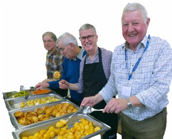
some members of the Christmas lunch serving team