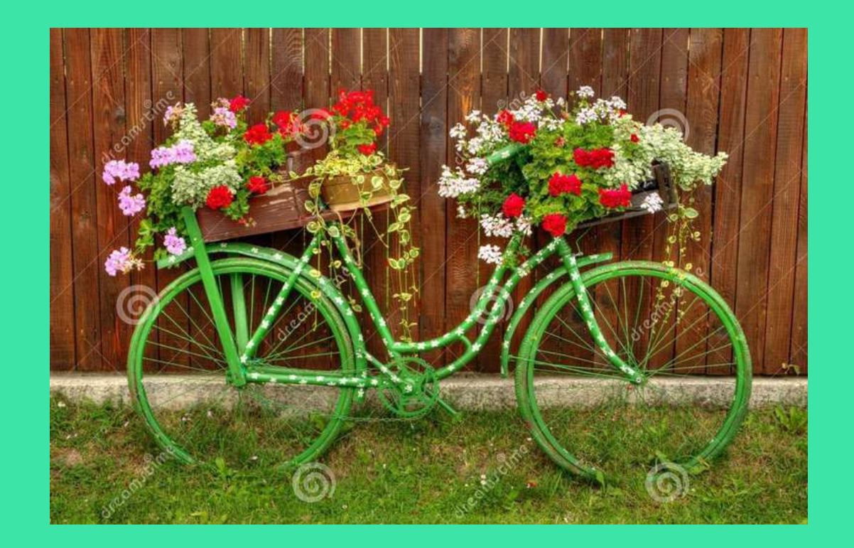
The new look for the Northumberland bikes

The pergola can be used a 'stage' or 'room'. We'll repaint the back wall, move the big table onto it, clean the decking, add decorations & more climbing plants