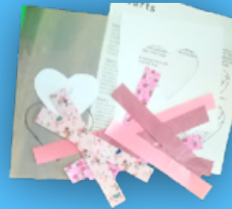
Papers and Aperture Cut