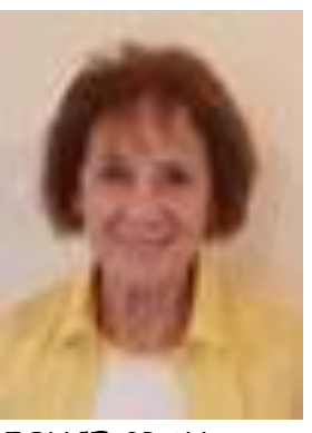
JOYCE GRAY PUBLICITY