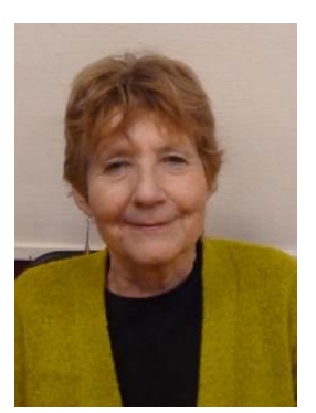
HEATHER LACE SAFEGUARDING & EQUALITY