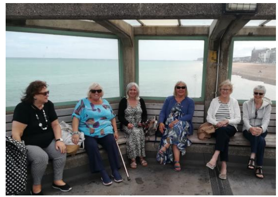
Time to relax on the pier after exploring the town.