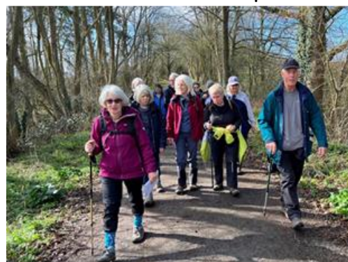
'Striding out on the Ayot Greenway'

Both my Woodside and SW Herts u3a's walking groups have been suffering from a diminishing number of active members, so the ability to open up one's group to another u3a