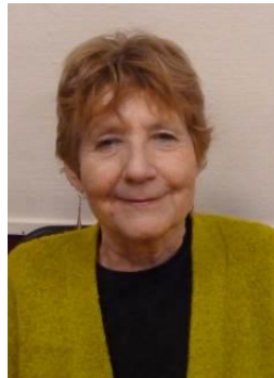
HEATHER LACE SAFEGUARDING & EQUALITY