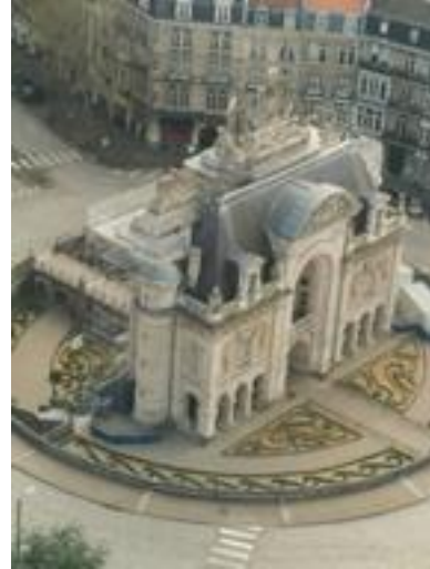
View from the

There were indeed a few unexpected linguistic challenges to deal with such as explaining a serious food allergy, seeking a repair for broken spectacles, an attack of vertigo, (we climbed to the top of the Bell Tower at the old Town Hall), and obtaining first aid for a sprained ankle.