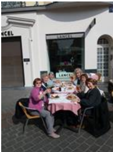
Lunch in the sun