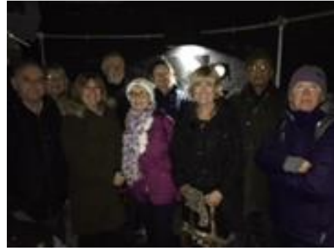
Thirty four members visited the Observatory

likely hood of there being life, of some sort, on one of the billions of other, possibly habitable, planets and how we, as humans, are sending out radio signals and information into space, however his personal opinion came across that he didn't believe in aliens.