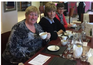
Some of the Spanish group celebrating one year together