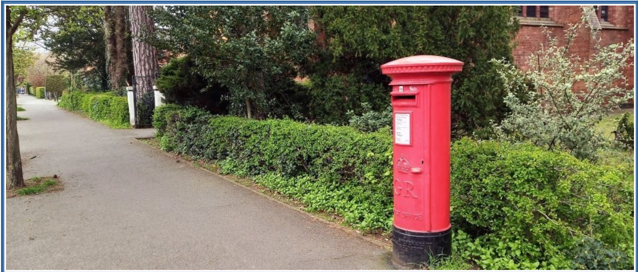
St. Peter's Gates