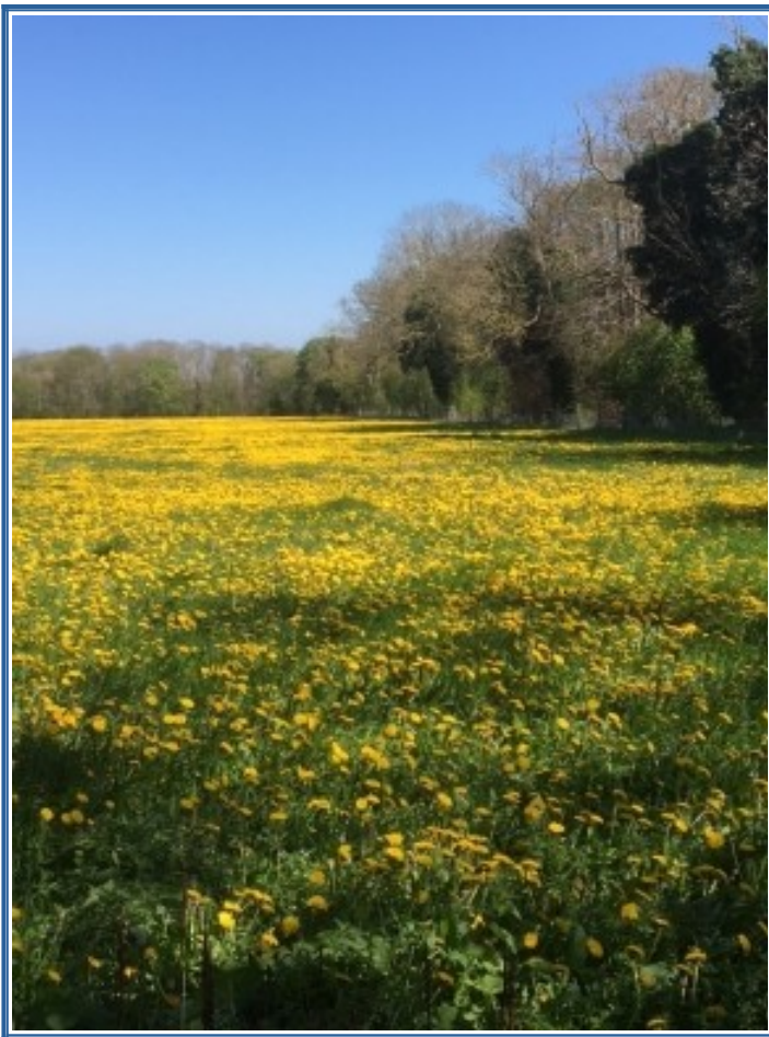
Field of Dandelions