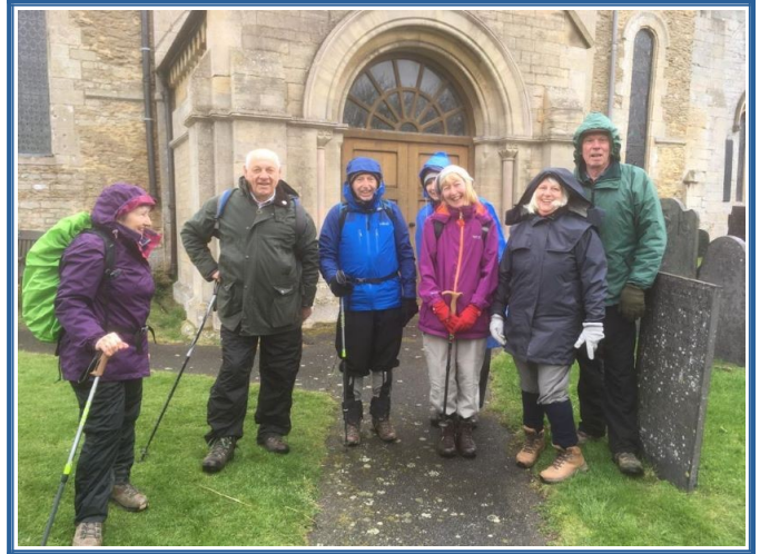
A Rainy Start

Most of us knew the villages and could recite the litany of Sempringham, Threkingham, Osbournby, Aswardby, Silk Willoughby. Sleaford, Ruskington, Dorrington, Digby, Scopwick, Blankney, Metheringham, Dunston, Nocton, Potterhanworth, Branston, Washingborough, Lincoln, but actually walking the 43 miles, over just four days, was a different matter and gives pause for thought. In the end we have a store of shared memories. The pouring rain, the four badly ploughed fields on the way to Silk Willoughby, the slender spire of Rowston, eating packed lunches around the table at Osbournby and Potter, coffee at Wetherspoons and popping corks in the sun at the Cathedral. But most of all, we had the companionship of friends on a shared enterprise.