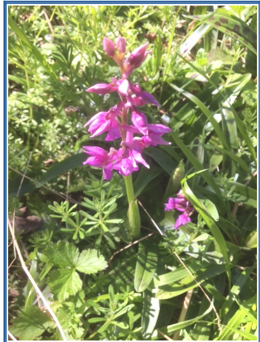
Early Purple Orchid