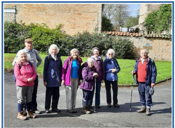
Washingborough Only 4.5 miles to Lincoln

Psalm 84 v5 "Blessed are those whose strength is in you, whose hearts are set on pilgrimage.