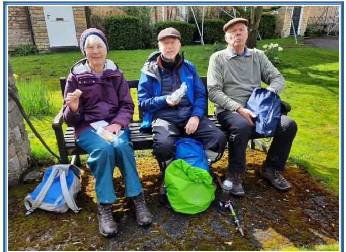
3 rd Age Lunch in the Sun