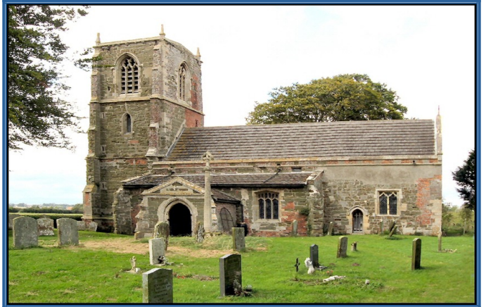
The Church of St Andrew