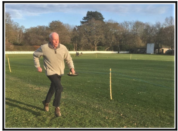
Striding to Victory