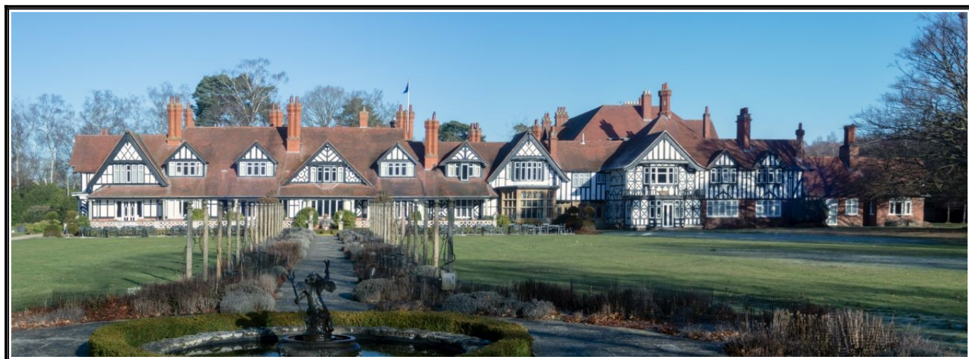
The Petwood Hotel