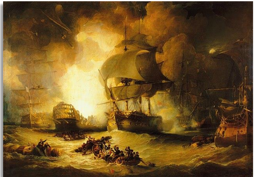
The Destruction of "L'Orient" at the Battle of the Nile, 1 August 1798 By George Arnald