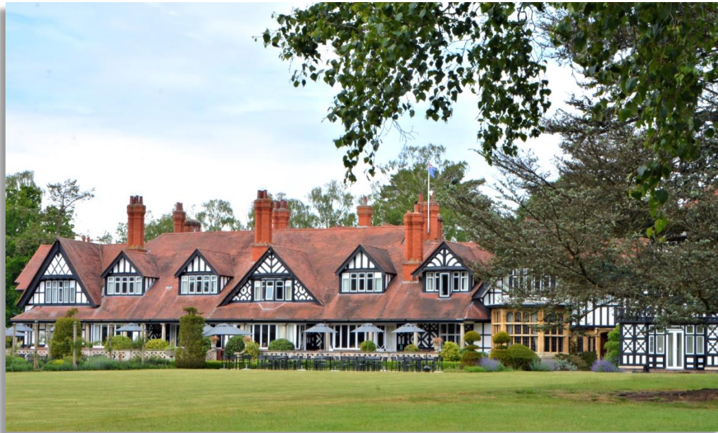
The Petwood Hotel