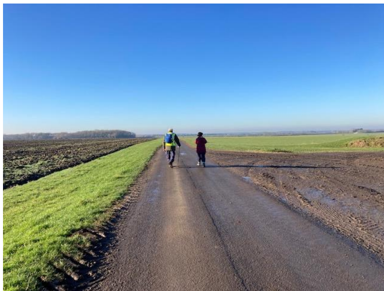
Winter skies in Lincolnshire

The road now snaked back towards Minting with Waddingworth to our left. This is another village that has declined and the church now stands alone in a farmyard.