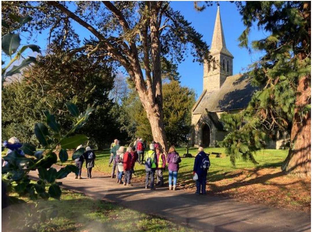
Rest stop at Wispington Church

A new church was also built at Wispington in 1863 but Wispington declined and the church was declared redundant in 1975. Walking out the back of the farmyard, we were greeted by an outstanding view towards Bardney Woods and the horizon beyond with a bright blue sky.