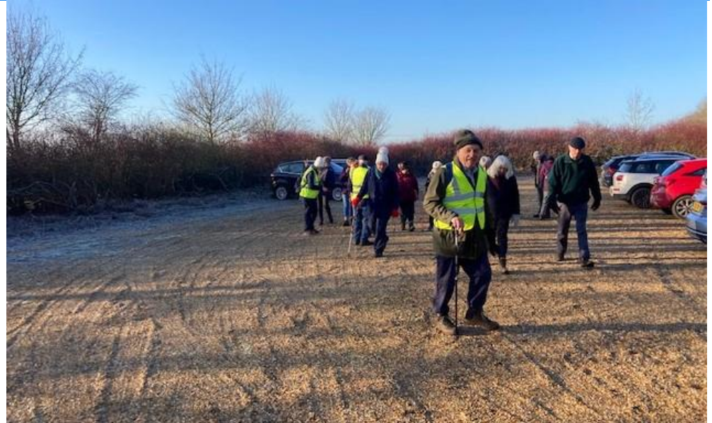
Setting off from Minting

Due to the recent rain it was decided to walk on the lanes rather than on footpaths.