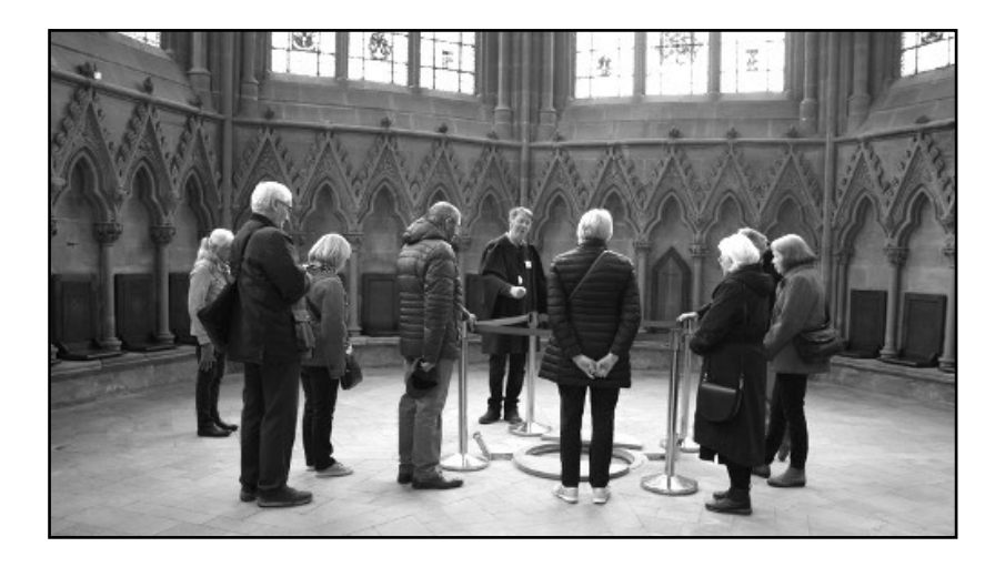
Inside the Chapter House

and the plans for the future. The team are presently working on the Chapter House and then plan to go onto the East End with its gigantic stained glass window. A fascinating fact was that during WW2 all the stained glass was placed in storage to protect it from bomb damage but the wood shavings used in the storage caused major damage to the glass anyway.