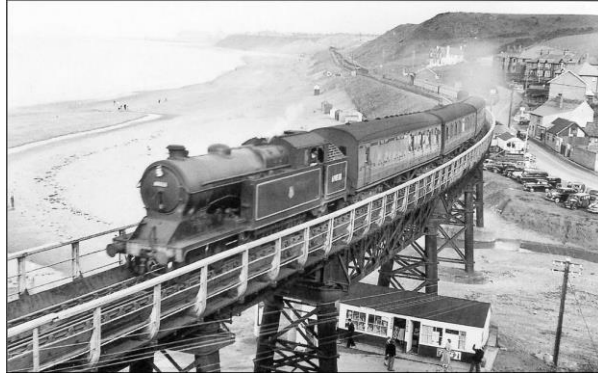
Sandsend railway viaduct, 1951