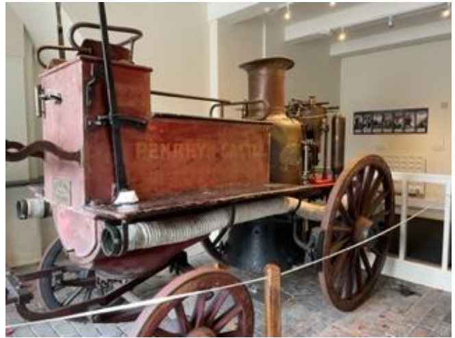
Photo taken of the steam engine in The Railway Museum for any train enthusiasts!