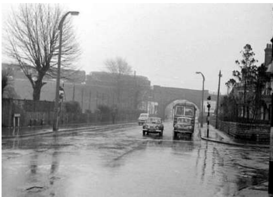
Train trundling over Melton Road

I am always intrigued by the disused lines, bridges, etc you see scattered around our locality, so I'm sure John will enlighten us on it all!