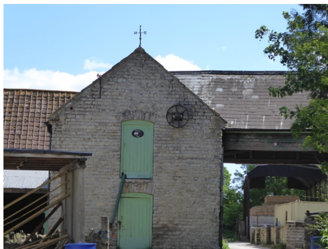
62 (same as 61)