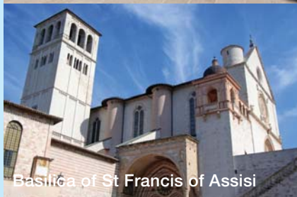
Basilica of St Francis of Assisi