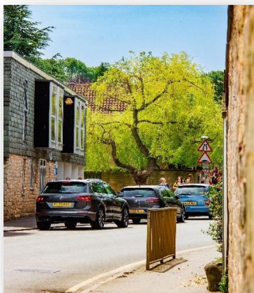
Joyce O'Neill - Woodhouse/ Jubilee