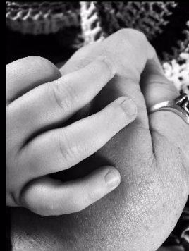
Yvonne Panner Rospaw -Green/Geometry