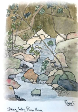
Shean, Lakes Pump House Roses, 2016