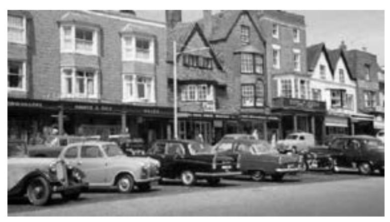
Late 50's Cars with lots of chrome to be polished.

Father cleaned our car every weekend and the bumpers particularly, which were chrome and not plastic, were cleaned and shone.