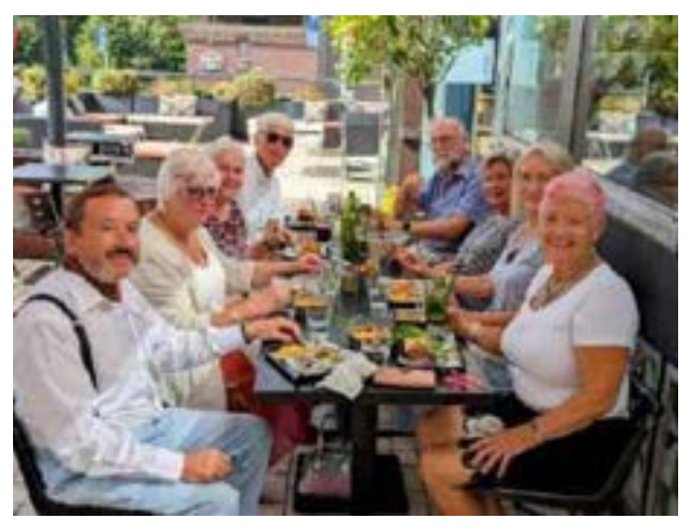
Members enjoying lunch at the Bonfire Restaurant

contract to design is what n o w considered to be one of the greatest examples of urban architecture in postwar Britain. The Barbican is also London's principal example of the Brutalist Style of architecture although some prefer to describe it as Tropical Modernism.