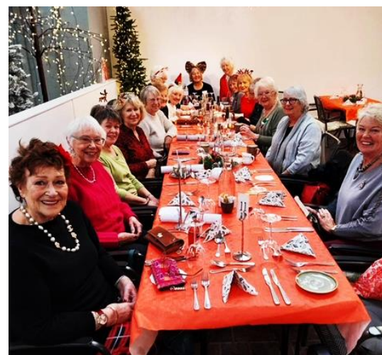
Singing for Fun's Christmas sing song and tea

No pictures of the Grumpy Men's group (too grumpy). They meet once a month on a Monday, also put the worlds to right, whilst enjoying a pint or two.