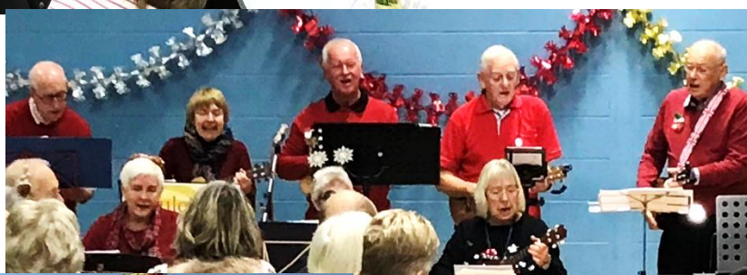
UKELELE SUNSHINE BAND