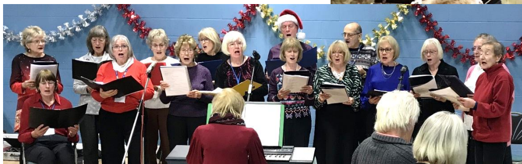
SINGING FOR FUN

Not so Grumpy Old Women group enjoying their Christmas (lunch) meeting at Burston's. They meet on the 2nd Friday of the month and enjoy having a general grumble, lots of discussion and laughter and a good cup of something hot.