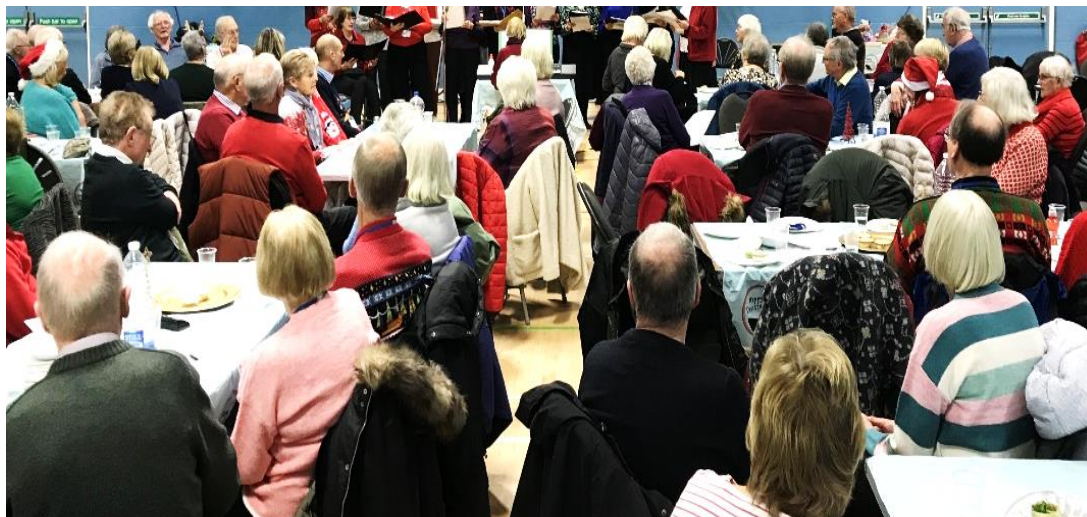
VCV Enjoying the Christmas Festivities