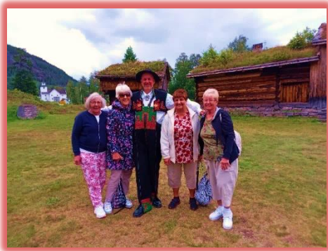
at Kristiansand, Norway, after a steam boat tour on Byglandsfjord.

There were many varied trips available, or some of our group chose to get on the hop on, hop off buses that were located nearby when we moored up.