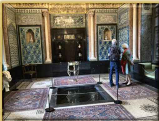
The Arab Hall with pool and fountain.

An interesting and impressive property in Kensington, a visit can be coupled with nearby Sambourne House Leighton House and Sambourne House | RBKC Museums . Alternatively, Holland Park with its Japanese and Dutch gardens is just a few minutes away, as is the Design Museum, both with cafeterias.