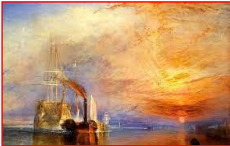
By JMW Turner The Fighting Temeraire being Tugged to her Final Berth to be broken up Oil on canvas 1839