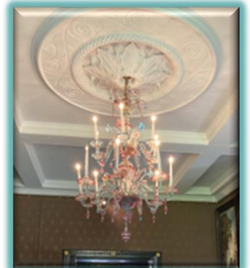
Colourful Floral Chandelier