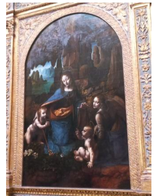
By Leonardo Da Vinci The Virgin of the Rocks Oil on wood 1483-86