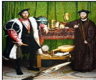
By Hans Holbein The Ambassadors oil on wood 1533