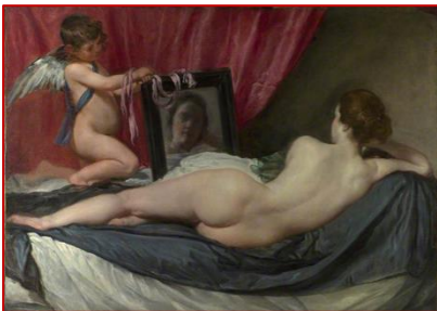
By Diego Velazquez, Toilet of Venus ("Rokeby Venus"), oil on canvas, 1647-51