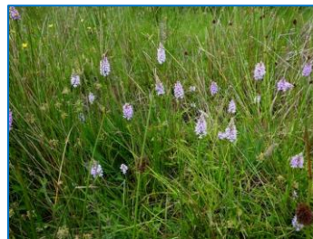
Common Spotted Orchid