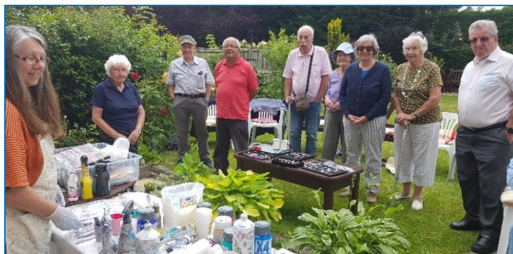
The theme was White on Black.