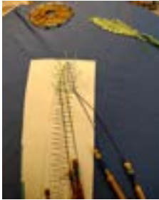
Create and Craft Group