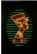
Out and About Group visit to Laing Art Gallery to view Visions of Ancient Egypt