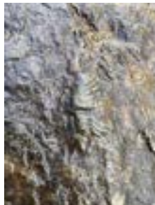
Northern Rocks Group