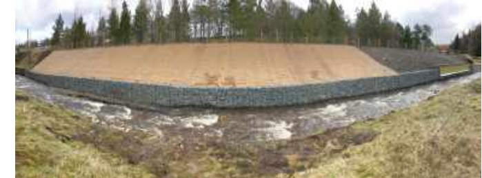
Nenthead car park river bank completed

All are welcome, but you must register online through the Tynedale u3a website 'What's On' section