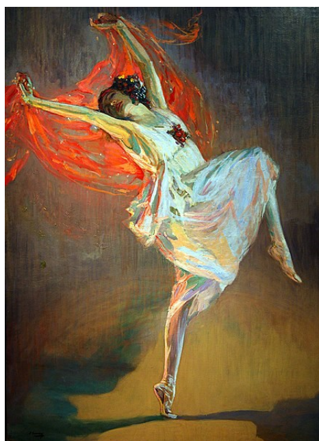
Anna Pavlova by John Lavery