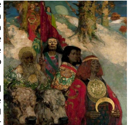
The druids: Bringing in the mistletoe by George Henry and Edward Hornel

Fortunately for me, a pre-planned visit to Glasgow for a music festival allowed me to visit the Kelvingrove Art Gallery and Museum, where there's a permanent exhibition of about 60 Glasgow Boys paintings. I realised that having started to research this topic, I could enjoy their work so much more. Needless to say, I loved the exhibition, and hope my enthusiasm was evident in the presentation.