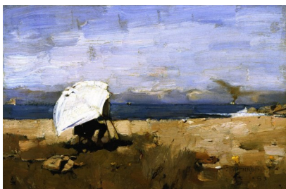
Hard at it

Every meeting has been so educational and enjoyable. There's always time for questions and discussion. The facilitating skills of the organisers and the friendliness of the group, as well as being amongst so many knowledgeable participants, has been a joy. I'm looking forward to the next series of meetings in the Wilfred room or on Zoom, which includes presentations about Haida monumental art, Jules Pascin, Mathias Grunewald, and architects who made history.