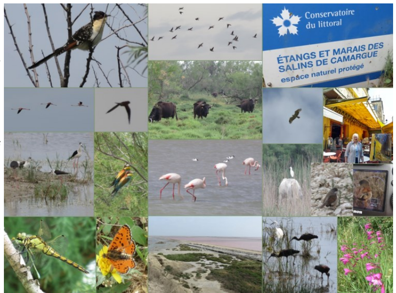
A selection of Jenny Loring's holiday pictures