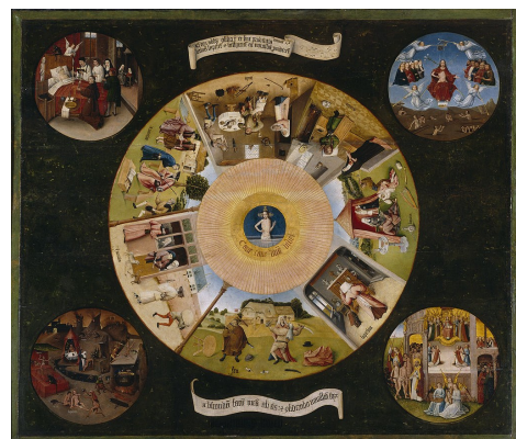
The Seven Deadly Sins and the Four Last Things Hieronymus Bosch

The talk is a humorous-serious look at the seven deadly sins.