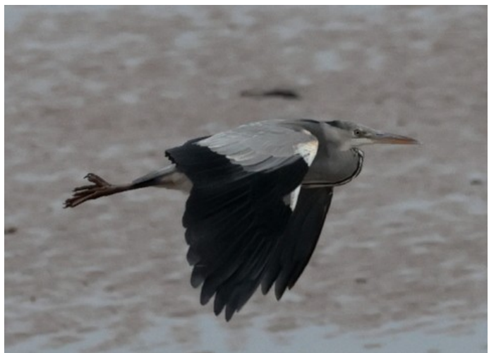
Grey Heron, Oldbury Power Station

We have travelled near and far to see a wide variety of birds. Locally the banks of the Severn are most interesting especially during the autumn migration. A surprising number of keen bird watchers arrived at the Somerset levels for an early morning start and the promise of bittern and numerous waders.