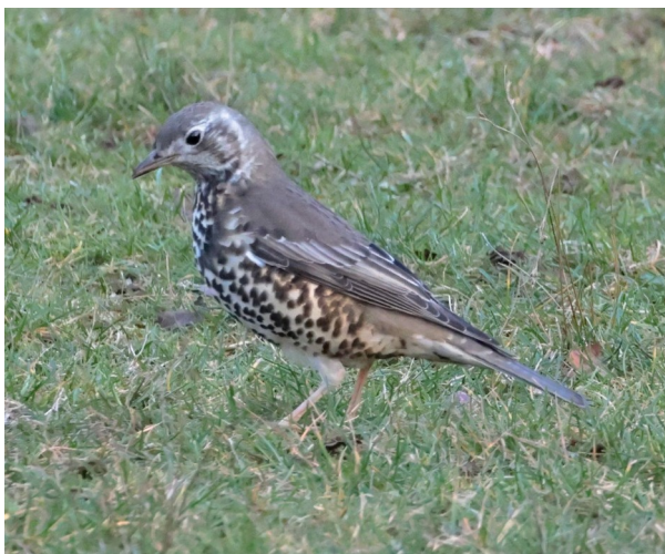
Mistle Thrush, New Fancy