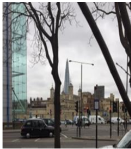
(Old meets new at the Tower)

After an easy train journey via Denmark Hill, we were in Wapping amongst the old wharves, now