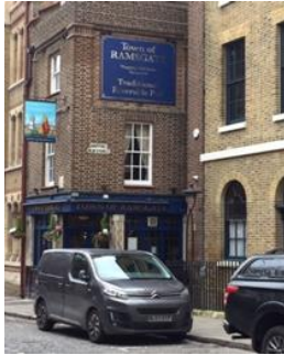
(Town of Ramsgate)