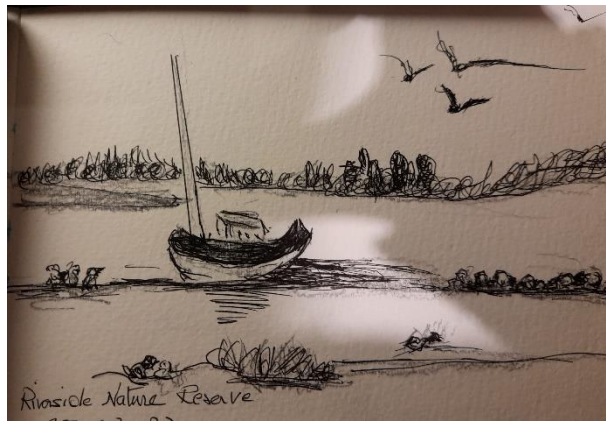
( Sketch courtesy Paule Inness )

Five group members met at Riverside Country Park, near Gillingham, on a dry but breezy morning. As soon as we saw the very low tide, we realised that we would not see many wading birds. They prefer to be at the water's edge foraging in the mud. The surrounding trees and scrubland were, unfortunately, quiet too.