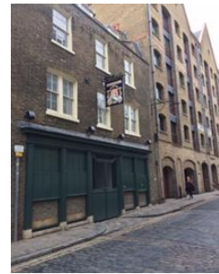
(Captain Kidd Pub)

miraculously transformed into £million plus apartments. We passed several examples of old Waterman's stairs including King Henry's Stairs (previously named Execution Dock), St John's School founded 1695 and some interesting old pubs that were still managing to survive. We continued our walk around St Katherine's Dock, around the perimeter of the Tower, Hermitage Basin and to the Captain Kidd pub for an excellent lunch.