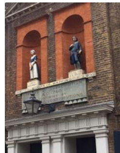
(St Johns School)