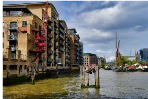
Tempus & Springfields Wharf