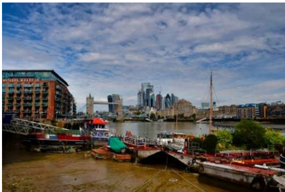
Butler Wharf - Barge Gardens – City