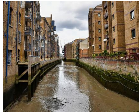
St Savior's Dock