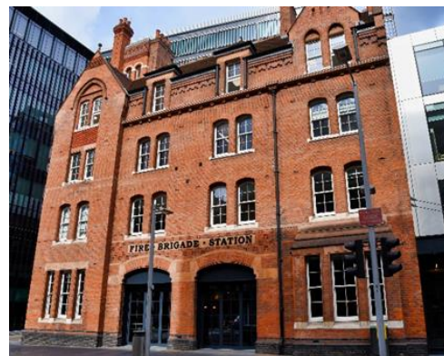
Tooley Street Fire Station