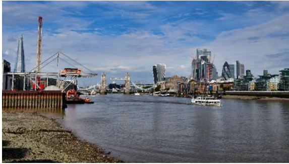
Chambers Wharf Jetty Tower Bridge & City