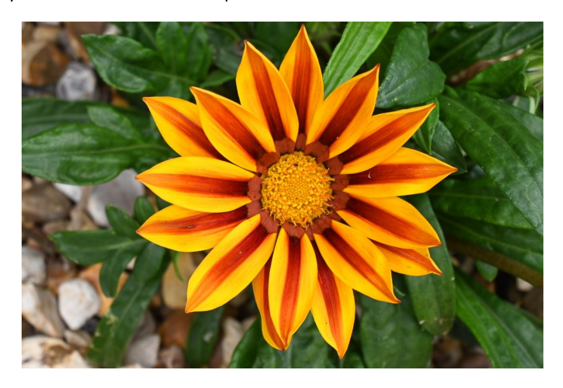
just to show that we have had some sunshine! Photo taken at Felbrigg Hall and Gardens, I am informed that the flower is a Gazania.

Hello everyone and welcome to the September Newsletter.