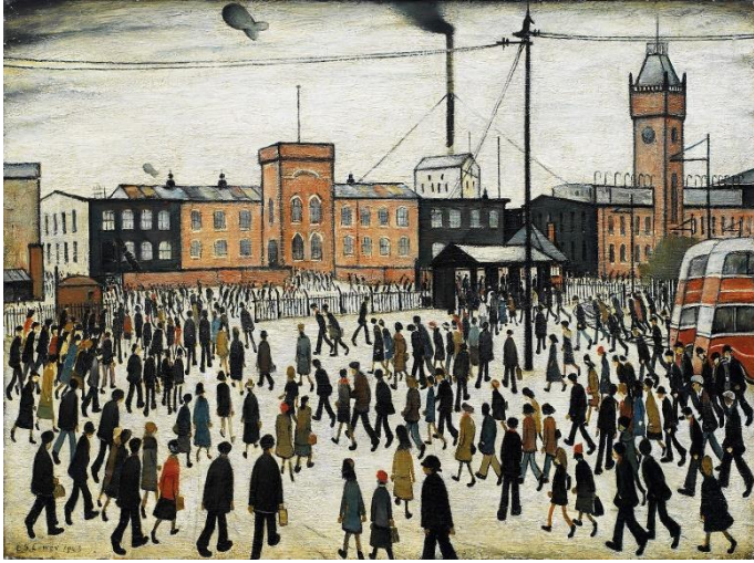
Going to Work