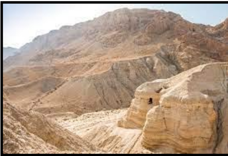
Above: Dead Sea Scrolls Jars Left: Qumran Caves & Scrolls