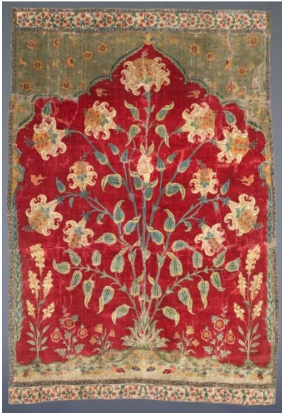
Fragment of a Saf Carpet, prayer mat Cashmere silk 1600-1650