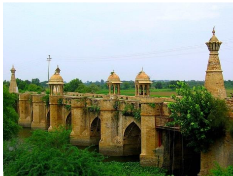
Noorabad Bridge near Morena