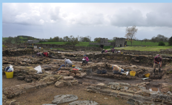
A selection of photographs taken during a recent trip to Hadrian's Wall by members of Sudbury u3a