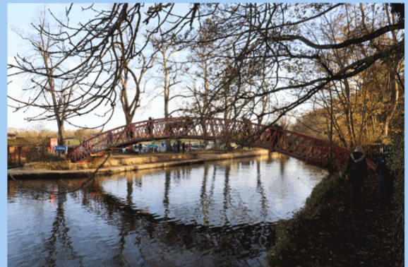
Oxford heading back from lunch at the Perch