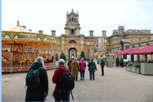
Blenheim ready for Christmas