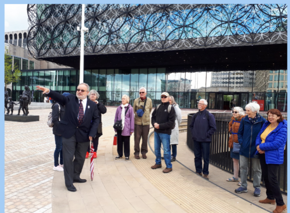
Birmingham 2022 Centenary Square and the new library