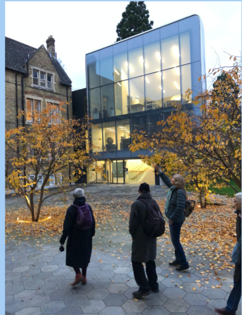
Oxford 2021 Modern Colleges walk-