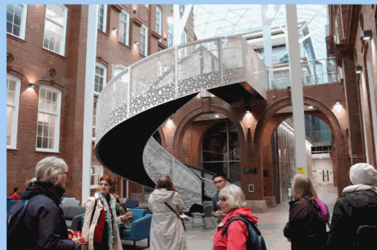
Sheffield Uni Tour