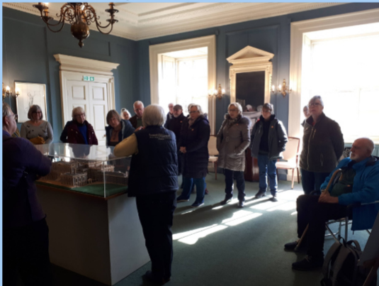
Sheffield 2022 Wentworth Woodhouse