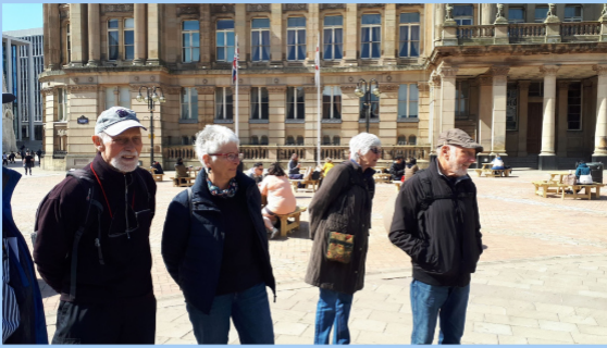
April 2021 Birmingham Chamberlain Square