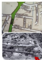
Kendall's Chemicals canalside by brewery