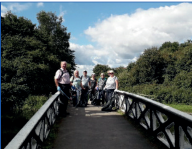
Members of the Canal Group collecting litter for the Canal & River Trust.