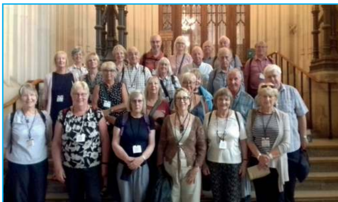
Houses of Parliament August 2019

Are you missing our Outings & Events? We have had some wonderful times over the past Ten years. Here's hoping we can be out and about again very soon.