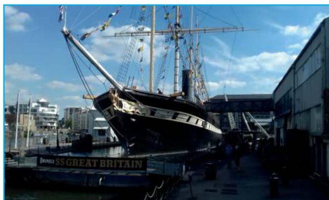
Brunel's SS Great Britain September 2018