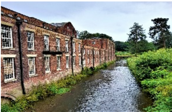
View of Quarry Bank Mill