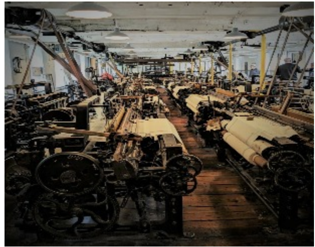
Working Mill Looms

The staff were very keen to give us information about how the process worked and one lady visitor asked to buy one of the cones of thread. The staff were quite surprised, so doubt, these will be appearing in the gift shop in the future.